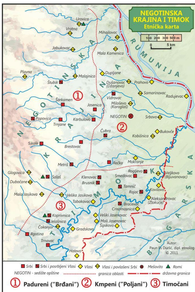
Figure 3. Detailed interactive map of the Negotinska krajina and Timok regions ( http://www.paundurlic.com/vlaski.recnik/mapa-timoceni.php )

The author categorizes the Vlachs, according to the geographical areas of North-Eastern Serbia they inhabit, into three main groups: 1) Eastern, 2) Central and 3) Western Vlachs. The linguistic groups presented on the map are: Ungureni ( Bănăţeni ) Vlachs, Munteni ( Bănăţeni ) Vlachs, Ţărani ( Olteni ) Vlachs, Buřani Vlachs, Bayash (Romanian speaking Roma) and Serbs. By clicking on one of the 17 sub-regions on the map, one gets more detailed micro-maps, with further categorizations of the Vlachs (as we can see from Figure 3 – Pădureni , Câmpeni , Timoceni , for example, in the Negotinska krajina and Timok regions), a complete network of settlements, and the possibility to click on them and to visualize the entire lexicographic material collected there or connected with that particular place (see Figure 4).